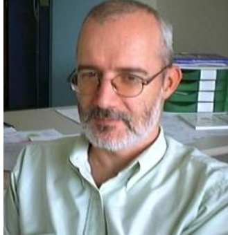
Associate-professor, Human Neurobiology Laboratory, University of Provence, Marseille, France